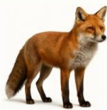
The Red Fox

The red fox is the most widespread wild predator in Germany. It is highly adaptable and lives in forests, fields, cities, and even villages. Its fur is usually reddish-brown with a lighter chest and a white-tipped tail. Red foxes are omnivores and eat mice, rabbits, birds, insects, fruit, and waste.