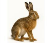
The European Hare

The male has small antlers, while the female does not. Roe deer are much smaller than red deer. They are often seen in fields and at the edges of forests.